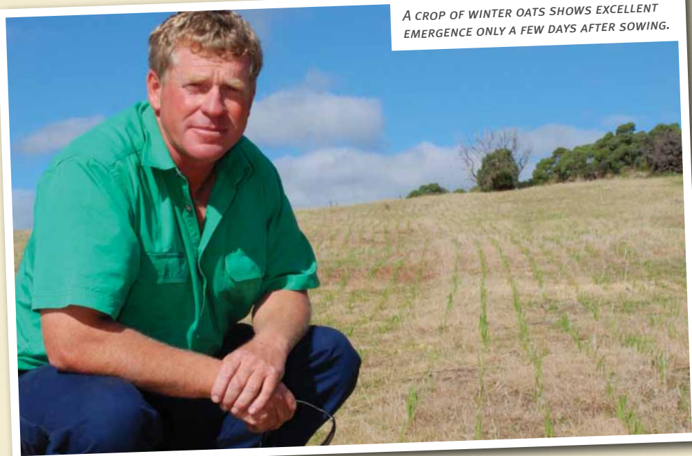
A CROP OF WINTER OATS SHOWS EXCELLENT EMERGENCE ONLY A FEW DAYS AFTER SOWING.

“We never talk about money because we get looked after and get the best prices always. We're in this game together – we need them and they need us. It's all about building good relationships.”