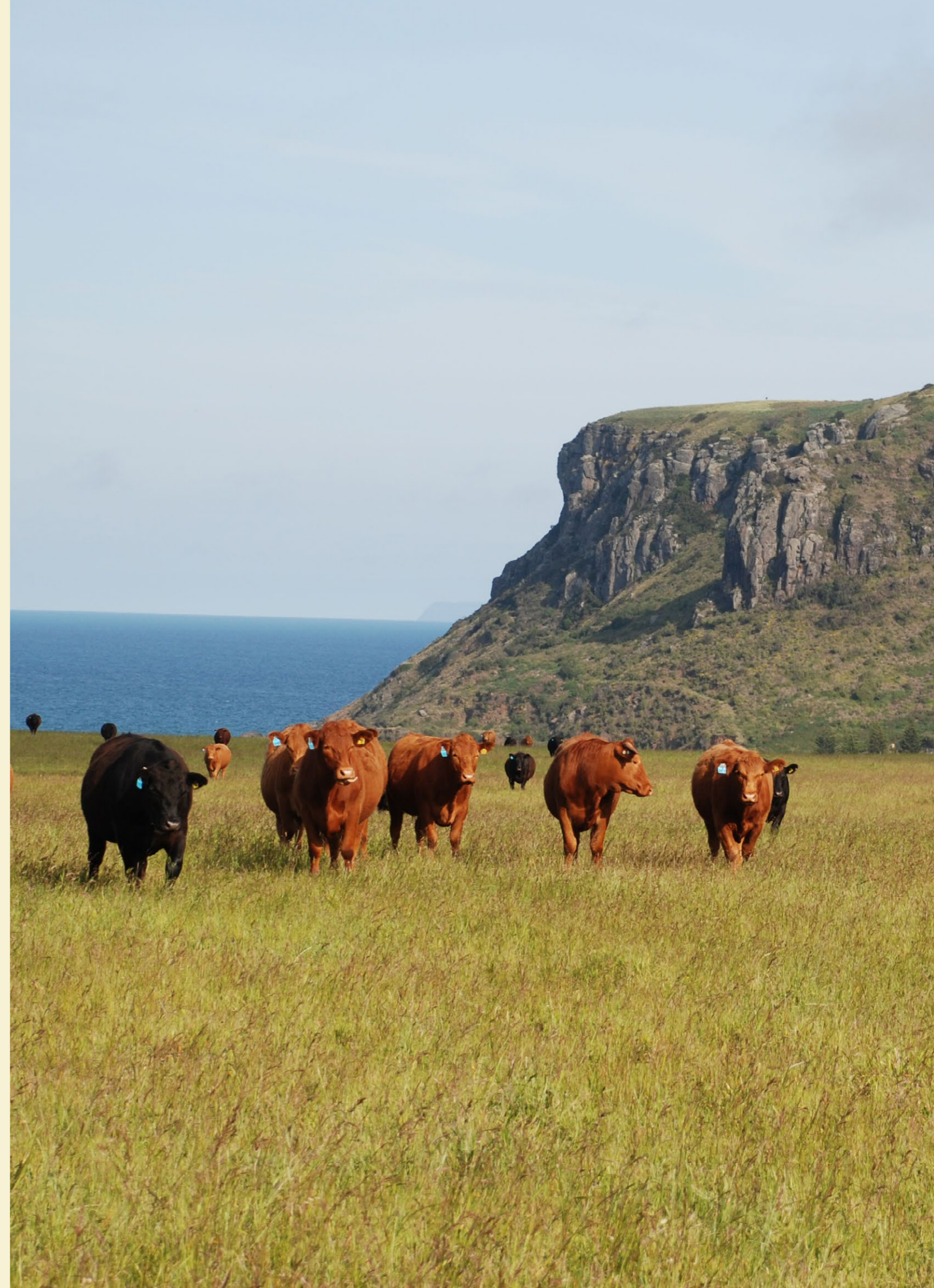
WILL HODGMAN MP PREMIER OF TASMANIA Valid to July 2017